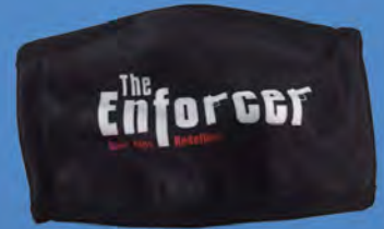
SEES-MASK-011 $5.00 EA