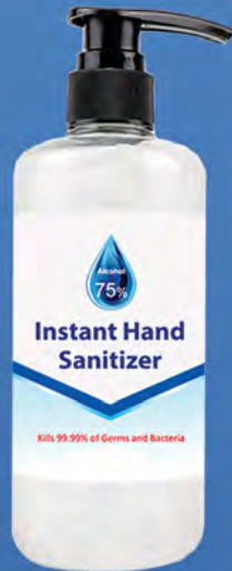
SEES-PPE-003 (29ML) $2.00 / $420 for case (288)