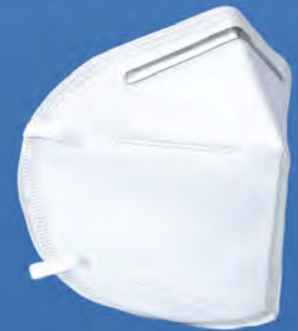
KN95 FACE MASKS