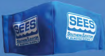
SEES-MASK-009 $5.00 EA