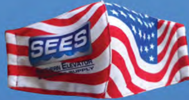
SEES-MASK-010 $5.00 EA