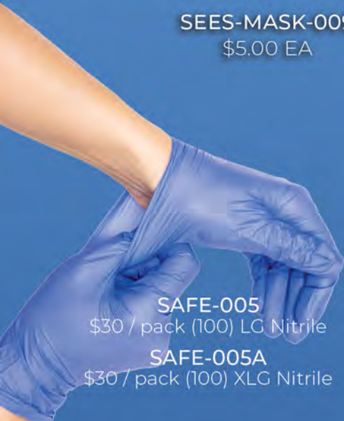
SAFE-005 $30 / pack (100) LG Nitrile