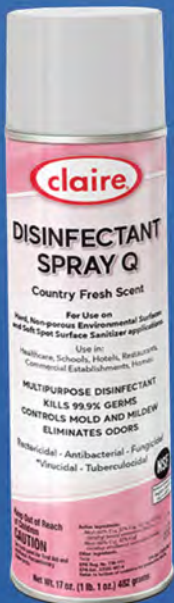
Disinfectant Spray SSEE-014 $100.00 for 12-pack