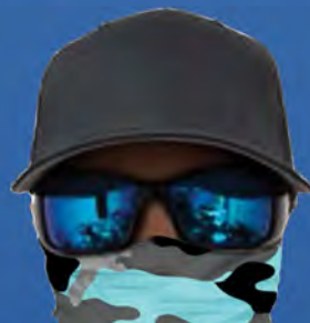
SEES-MASK-004 $3.00 EA