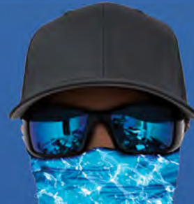
SEES-MASK-006 $3.00 EA