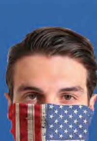
SEES-MASK-003 $3.00 EA