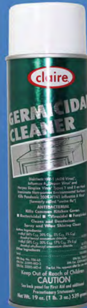
Germicidal Cleaner SSEE-013 $120.00 for 12-pack