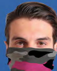
SEES-MASK-005 $3.00 EA