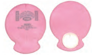
MIS-500B (Front, Back)